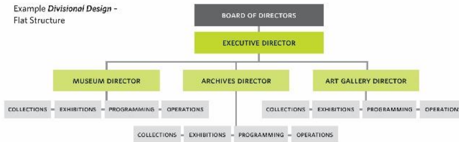
Example Divisional Design - Flat Structure

Functional Design / Hierarchical Structure